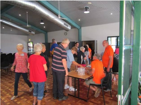
Sign on and raffle ticket sales