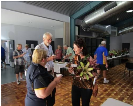
A visitor delighted with her selection