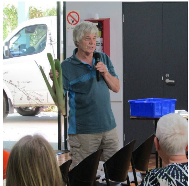
A detailed description of plants by Sue, Nigel and Eric