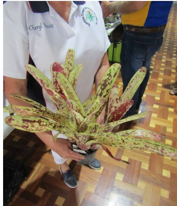
Second (7 Votes) Cheryl Basic Bilbergia Ebony & Ivory