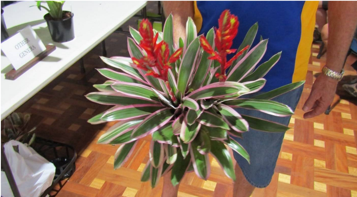
First (15 Votes) Stan Walkley Vriesea Rosita