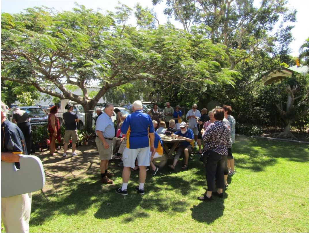
Plenty of activity prior to start of meeting