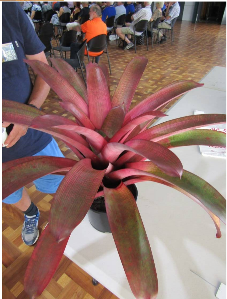
Right Second - (6 Votes) Greg Jones Greenline x Gultz