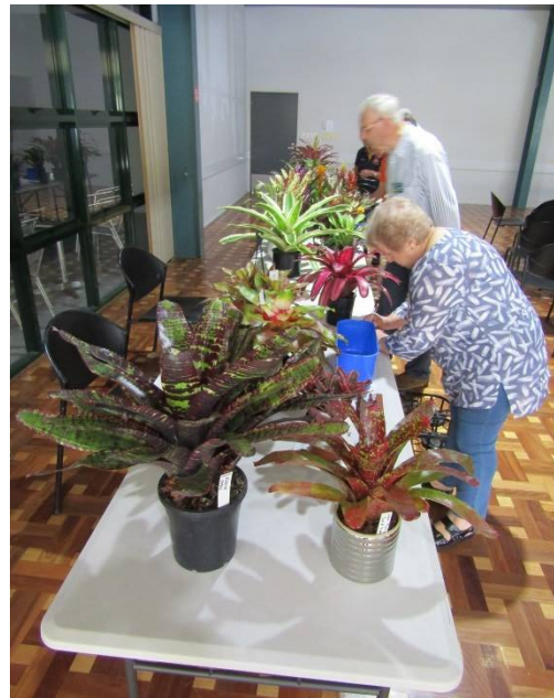
Popular Choice casting votes