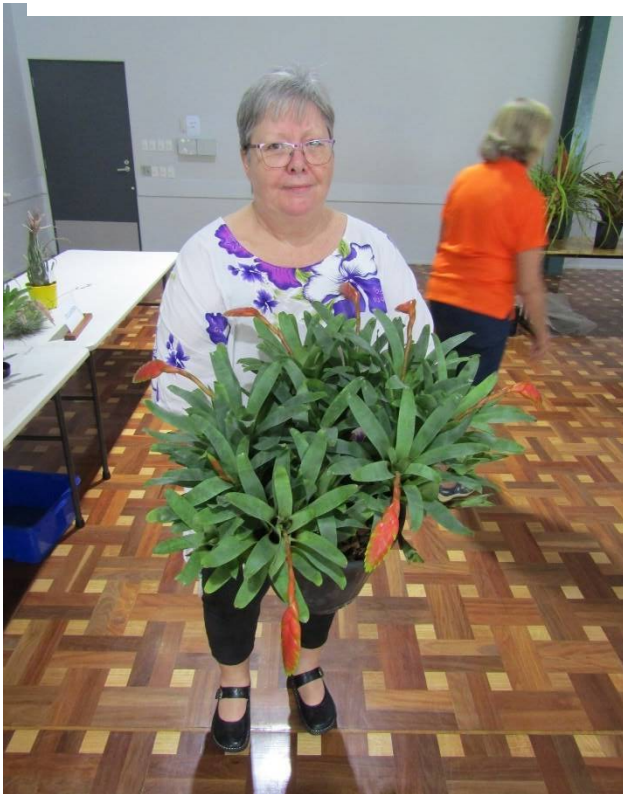
Second (8Votes) - Sue Murray Vriesea rubyae