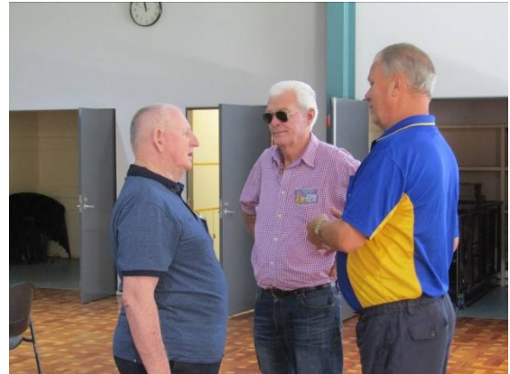
Always something of interest