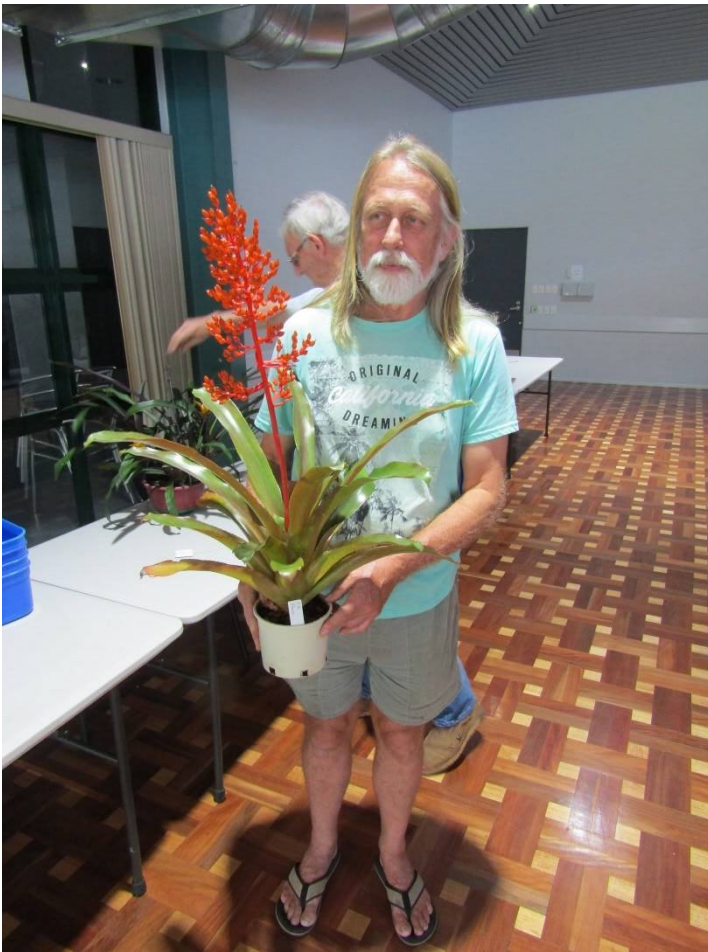
Left First - (12 Votes) Uldis Mize Aechmea Flame