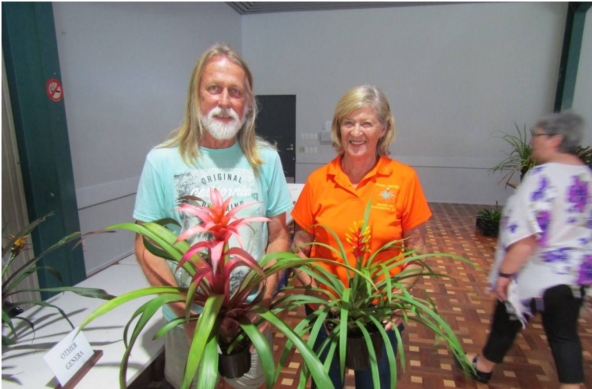
Equal First (7 Votes)