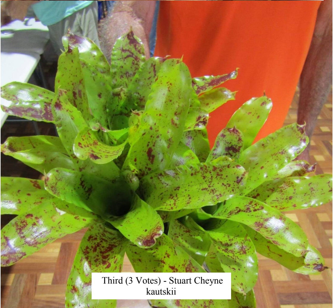
Third (3 Votes) - Stuart Cheyne kautskii