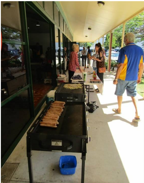
Two BBQ's set up for an expected large turn up