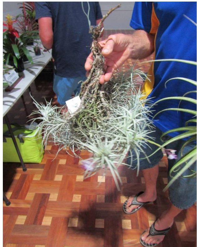
Third (4 Votes) -- Stan Walkley Tillandsia tectorum x palacea